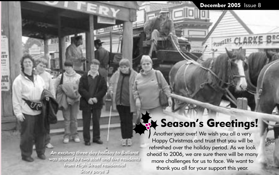
An exciting three day holiday to Ballarat was shared by two staff and five residents from High Street residential Story page 3