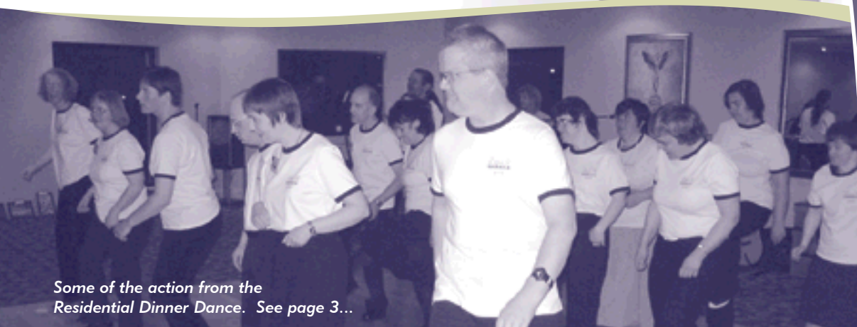
Some of the action from the Residential Dinner Dance. See page 3...